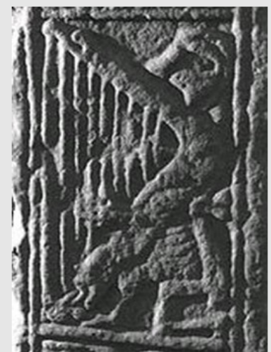
The harpist on the Dupplin Cross, Scotland, c. 800 AD