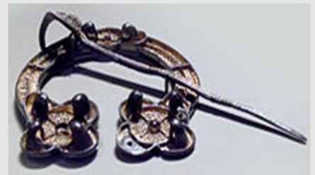
The Whitecleuch Chain, high status Pictish Silver chain, one of ten known to exist, dating from between 400 and 800 AD