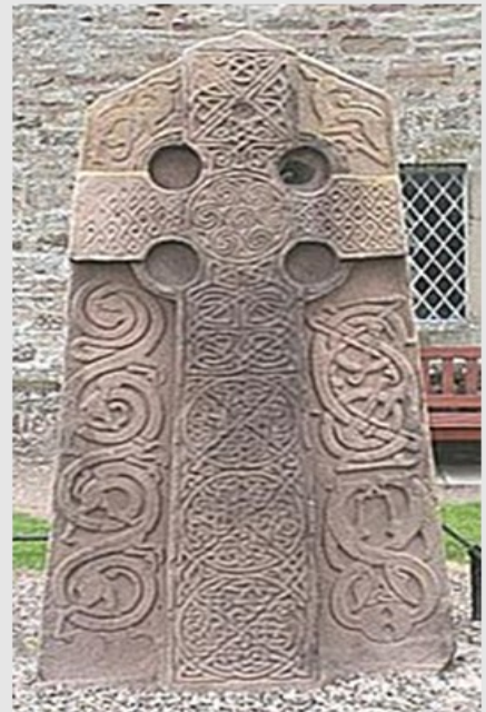
The Aberlemno Kirkyard Stone, Pictish stone

There may have been some Picts who converted to Christianity in the Roman period but as a whole they probably converted in the 6 th Century. Missionaries from Britain went to the south and from the Gaels to the west. Great relief cross-slabs found across eastern Scotland best characterises the Verturian Kingdom. These carved stone monuments, several metres high, generally have a cross and abstract imagery on one side, and naturalistic depictions, some secular and some scriptural, on the reverse.