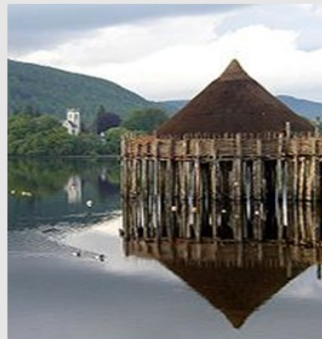
Reconstructed crannog on Loch Tay

From Archaeological evidence it is known that the Picts, like most people in the North of Europe around this time, were farmers living in small communities. They had cattle and horses which were a sign of wealth and prestige. The Picts also had sheep and pigs both of which were kept in large numbers. These animals were small by later day standards. Carvings show that the Picts had hunting dogs and also hunted with falcons. Their cereal crops included wheat, oats, barley and rye. Vegetables include kale, cabbage, onions, leeks, peas, beans, turnips, carrots and some types that are no longer common like skirret. Plants such as wild garlic, nettles and watercress may have been gathered in the wild. Wool was the main source of fibre for clothing. Flax was also common. Fish, shellfish, seals and whales were also used in settlements near the coasts and rivers. There is no evidence of towns in Scotland until the 12 th century. Recent archaeological evidence has been found that watermills existed at this time in Pictland. Kilns were used for drying kernels of wheat and barley.