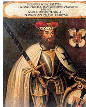
(Hermann von Salza served as the fourth Grand Master of the Teutonic Knights (1209 to 1239))

for allegedly being under Papal rule instead of the Hungarian Sovereignty.