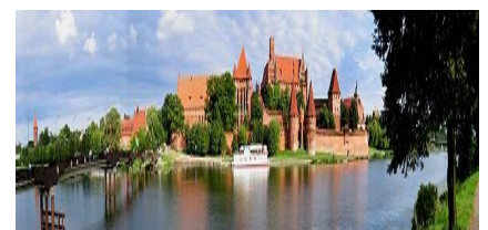
(Picture: Marienburg Castle, Monastic state of the Teutonic Knights, now Malbork, Poland)

The attire of the Teutonic Knights was a White mantle with a black cross which they wore on the surcoats. Sometimes a cross pattee (a type of cross which has arms narrow at the centre, and broader at the perimeter) was used on their coat of arms. The motto of the Teutonic Knight's Order was: 'Help, Defend, Heal'.