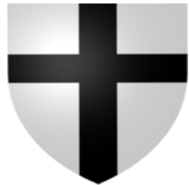
(Coat of arms of the Teutonic Order)

Currently the Teutonic Knights operate in Central Europe with charitable aims.