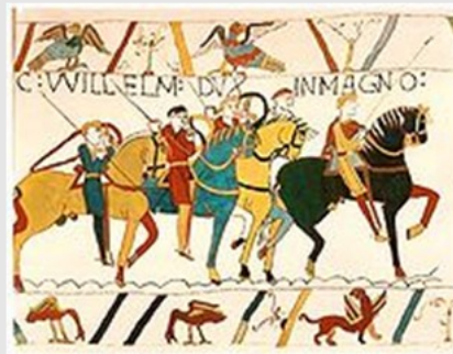
William the Conqueror invades England

The Normans adopted the growing feudal doctrines of the rest of northern France and worked them into a functional hierarchical system. The Norman warrior class was new and distinct from the old French aristocracy. Most knights remained poor with their title only indicating that they were a professional warrior wealthy enough to own their own war horse.